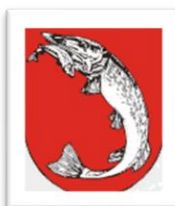
Dolní Benešov (CZECH REPUBLIC)