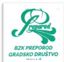
Bihać (BOSNIA AND HERZEGOVINA)