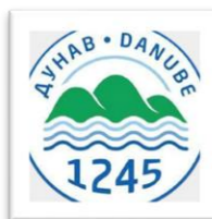
Sremski Karlovci (SERBIA)